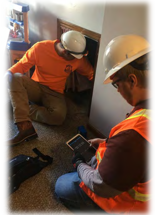
Interior dust sampling